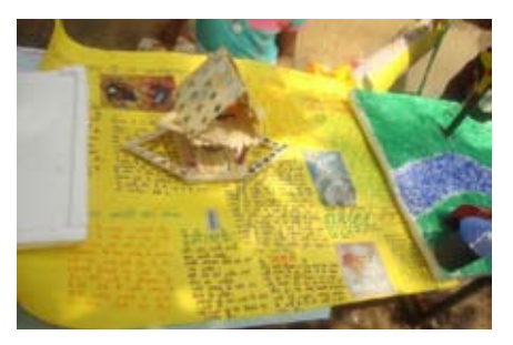
Projects were creative and ranged from environment to village life